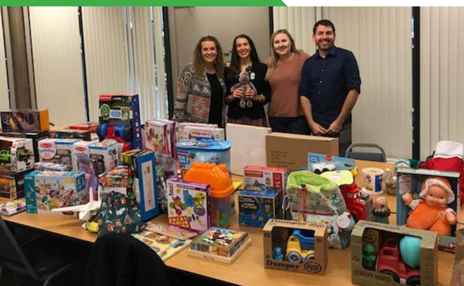
Time Once Again to "Give Locally" See page 3.