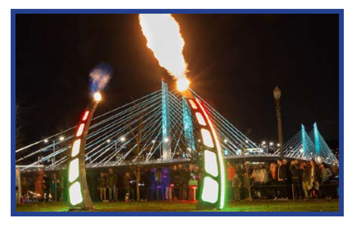
Portland Winter Light Festival; February 6-8.