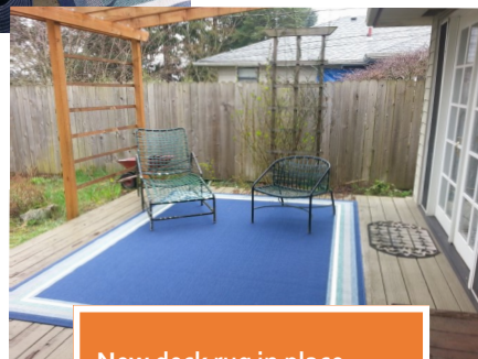
New deck rug in place