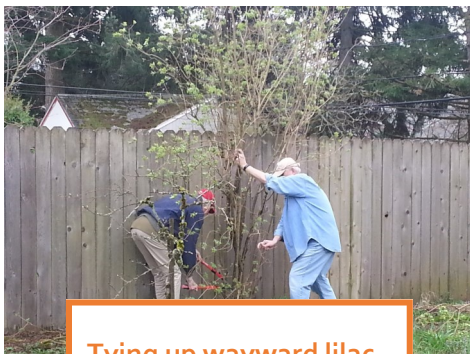
Tying up wayward lilac

Sitting on my deck in the sunset was so pleasant, enjoying the cleaned up space. I know that my membership allows me to ask for help, but I still fight that little voice that says I should be able to do it myself. Providing lunch and drinks makes that voice quiet down, and the comradery of friends helping friends is priceless."